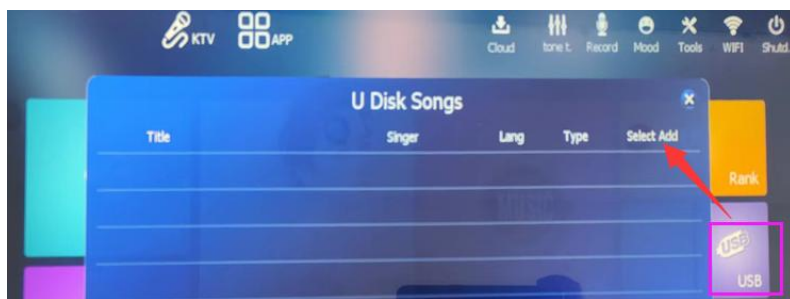
Add songs display