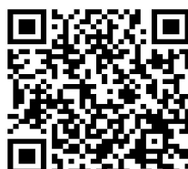
Mobile App control