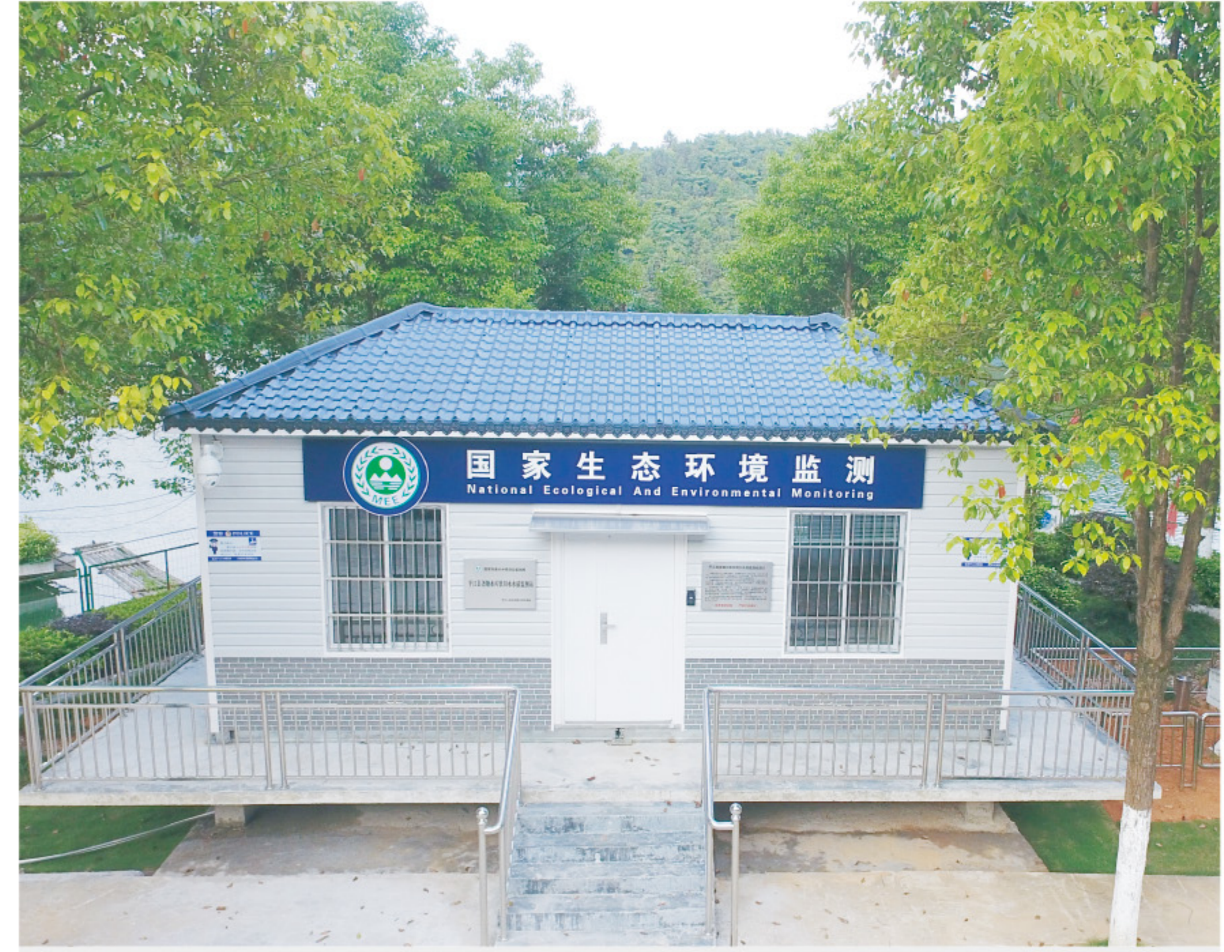
Water Quality Monitoring Site