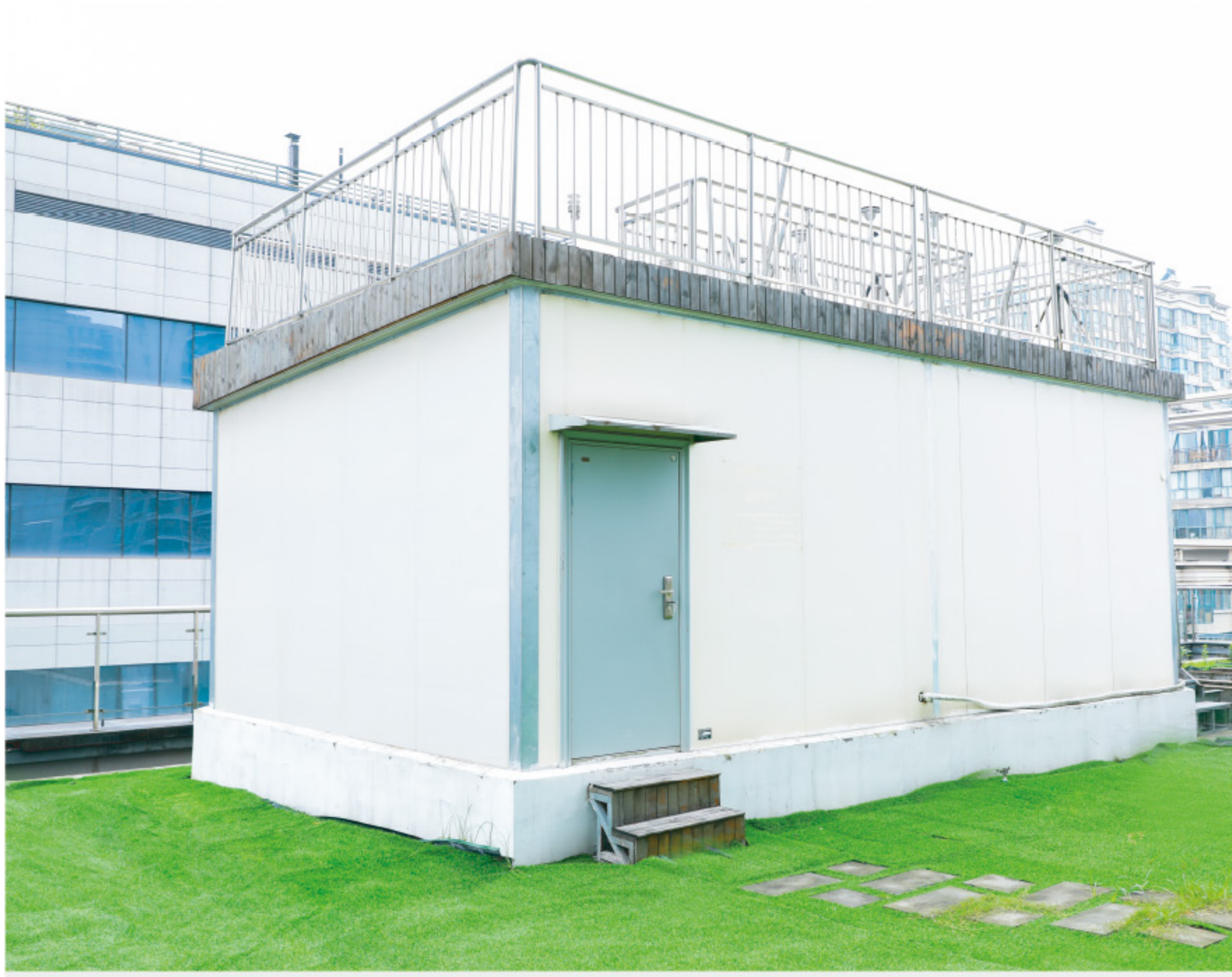
Air Quality Monitoring Site